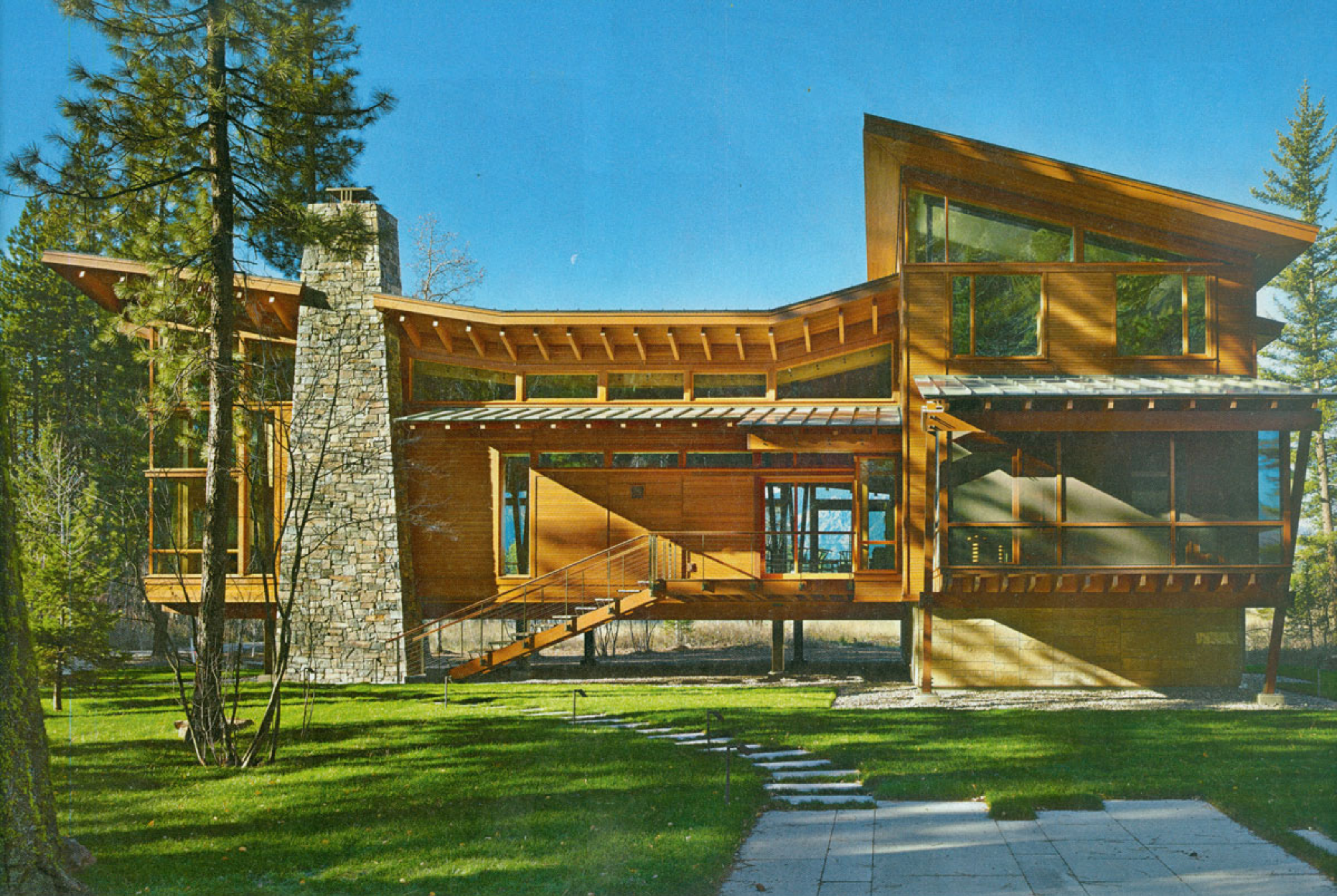
The home , Finne's translation of "crafted modernism," sits nestled among the trees at the head of an expansive meadow. A two-story bedroom wing anchors the living pavilion, which appears to hover over the meadow.